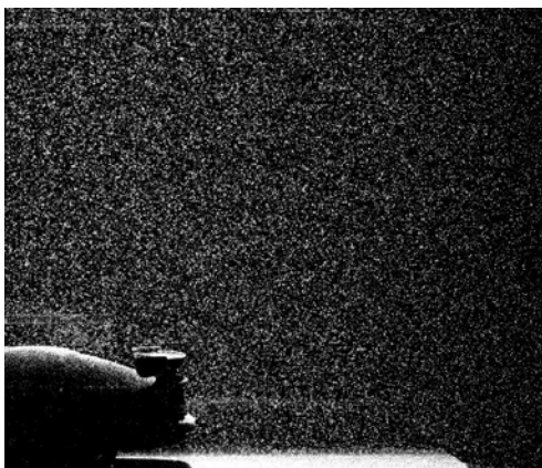
Fig. 2: Sample image from one of the V3V-8000 apertures.

In this experiment, the flow covering the entire region behind an automobile model was taken. The objective is to investigate the flow behavior in the volumetric region. With the employment of the V3V system, the instantaneous flow characteristics were revealed, showing wake flows behind the mirrors and the trailing flow toward the rear end of the model. Overall the measurement provides a holistic view of the flow behavior; hence it can facilitate changes on the automobile body and various parts to meet the aerodynamics requirement for the design.