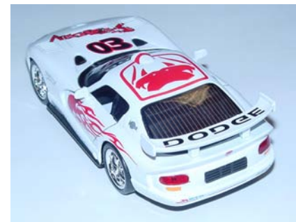
Fig. 1: Photograph of the automobile on which wake measurements were taken.

Wake flow is of great interest in many practical situations. In automobile industry, particular attention is given on flow around and behind an automobile to ensure the design to provide a safe, smooth and comfortable ride for the passengers. Flow around and behind the side mirrors of an automobile has significant effect on the noise generation. Flow in region between the top and the rear of the automobile may contribute to the stability of the automobile when it is cruising on the highway. In particular, the position of the spoiler, like the one shown in Fig. 1, determines the wake flow behaviour and allows the automobile to accelerate more quickly to high speed with some effect on the downstream aerodynamics.