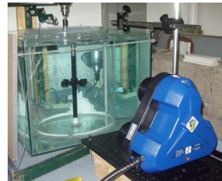
Fig. 1: Photograph of the experimental setup showing the position of the 3D camera relative to the mixer.

V3V was applied to the Rushton turbine flow for two primary reasons. First, flows in stirred tanks are extremely important to a wide range of engineering disciplines. Second, the flow is extremely complex and highly three-dimensional, making it a suitable test case for the volumetric measurements. Figure 1 shows a photo of the experimental setup.